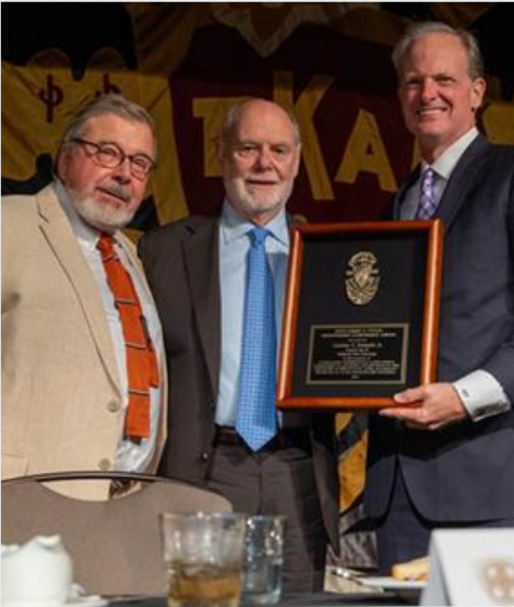
YOU Transform PIKE