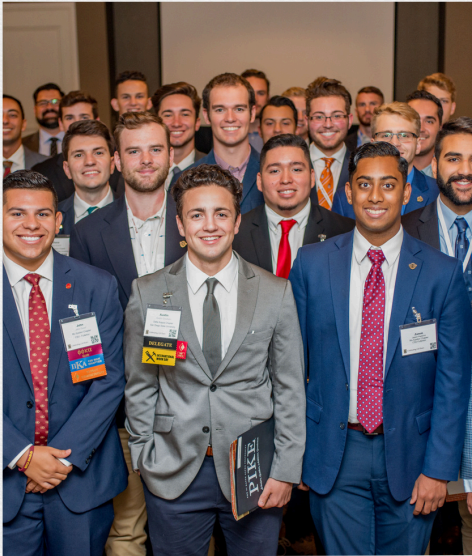
PIKE Transforms Men